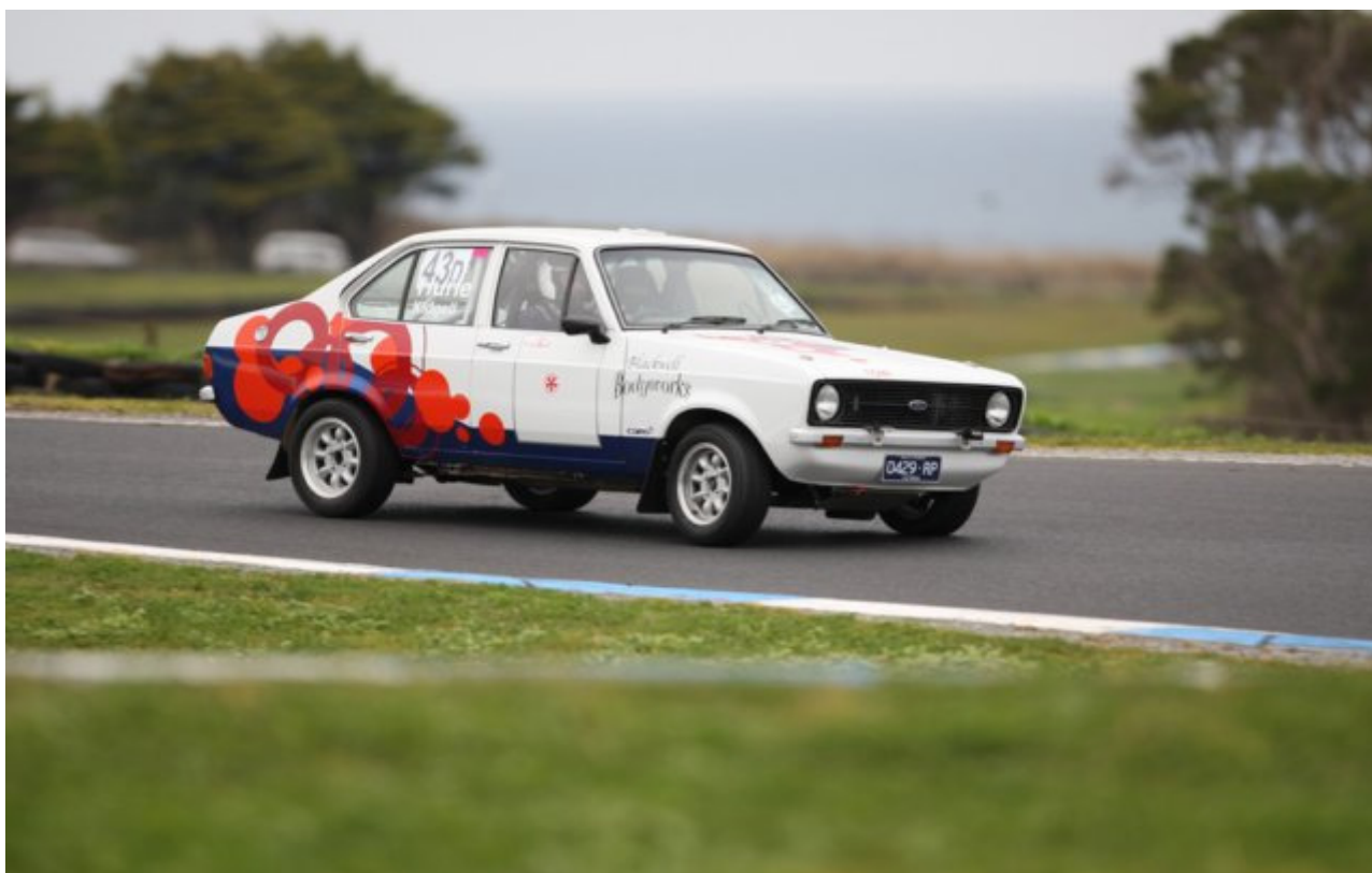
The Hurlé's Escort in action

Sunday Coffee: Some members gather for an informal meeting on Sunday mornings at Lakeside Pakenham approx. 8.00a.m. This is a good chance to take your club permitted car for a run, just make sure you shove this copy of “The Oil Rag” in the glove box.