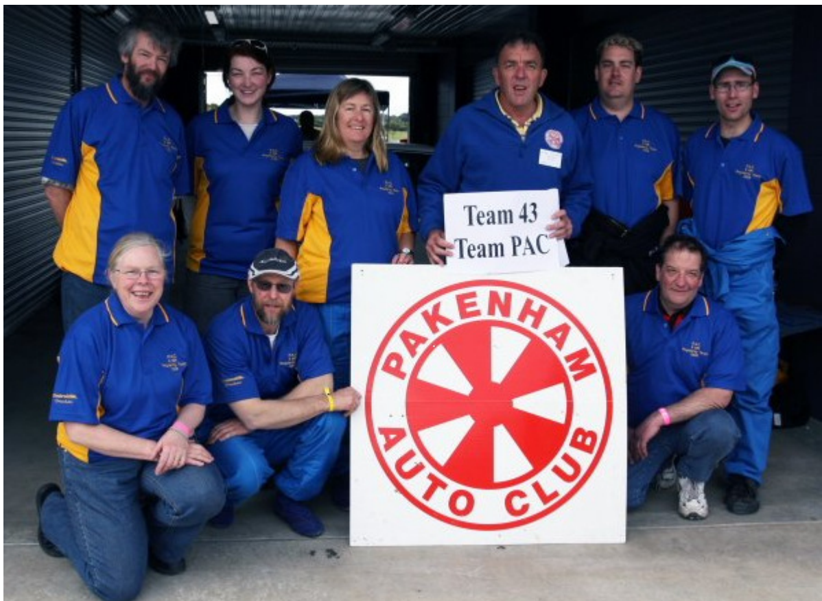
The PAC 2008 Six Hour Regularity Team – will you be in this year's photo?

The Monthly Newsletter of the Pakenham Auto Club AUGUST 2009