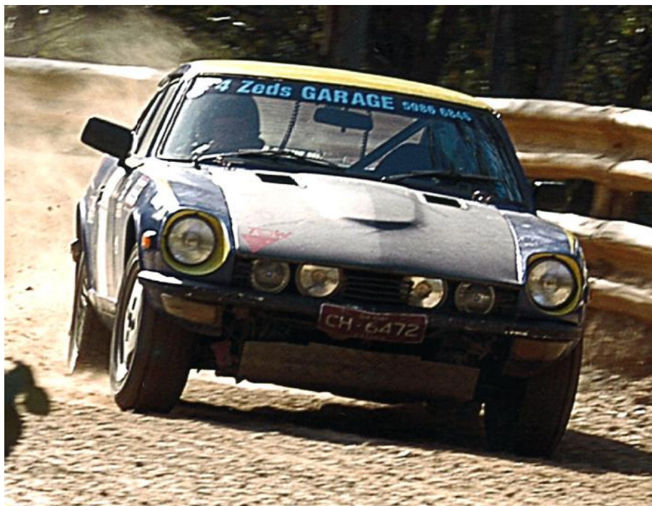
Bruce Dunn in action

The September VCAS round will be on Saturday 27 th at Melton and will be run by CCRMIT. Supp regs will be available soon.